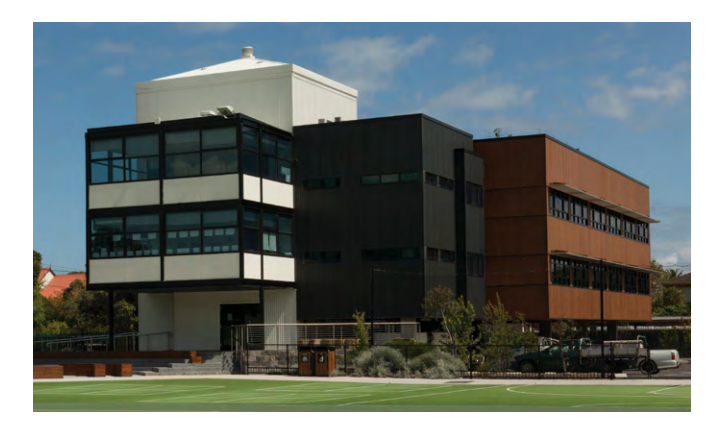
Award winning Year 5 and 6 Model